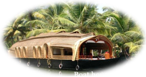
Experience the luxury of living in a houseboat in Vembanad lake