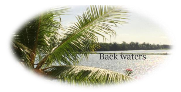
Rejuvenating ride in the backwaters

Kerala has a moderate climate throughout the year with warm and pleasant tropical monsoon climate with seasonally excessive rainfall. November to January offers the best season to visit the hill stations and beaches of Kerala